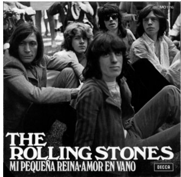
The Rolling Stones, May, 1969 - late 1974: Charlie Watts, Mick Taylor, Bill Wyman, Mick Taylor, Keith Richards, and Mick Jagger.

flood is threat'ning..." passage in verse 3; refrain ("War children...") different from official version; piano Nicky Hopkins; percussion Jimmy Miller; Cut 10: Verse 2 started with "See the fire is sweeping / my very life today" (as opposed to "...our very street today" in all other versions); recorded February 22-25, 1969; Cut 11: Additional vocals Keith Richards; also known as "Acetate Version" or Gimmie Some Shelter (which doesn't make much sense since every version contains the "If I don't get some shelter" - line); replacing "a red coal carpet" in verse 2 by "a burning carpet"; recorded March 15, 1969; Cut 12: Early slow version, incomplete lyrics.